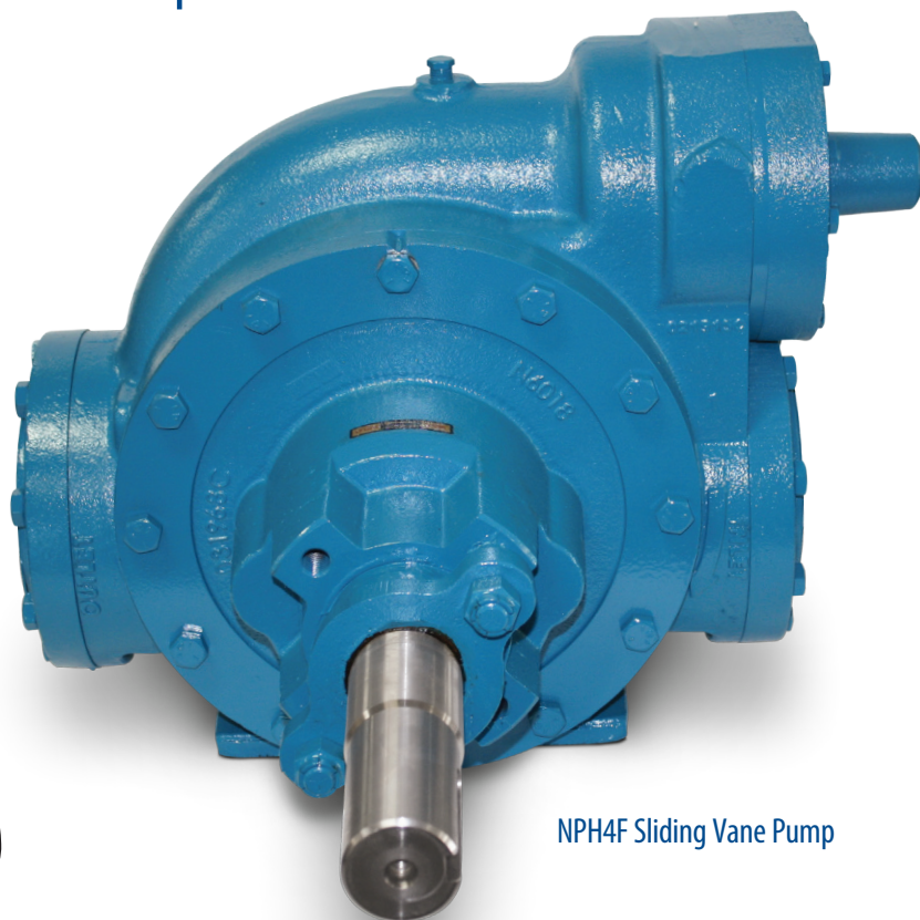
NPH4F Sliding Vane Pump