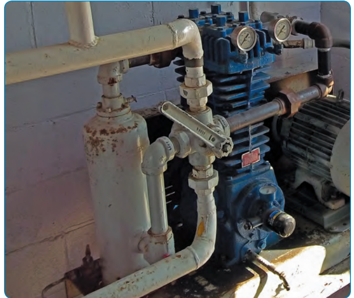
The key component of Bowman Gas' LPG storage and transfer operation at the 120,000-gallon capacity storage facility at its Gulliver, MI, headquarters is a Blackmer® LB601 Reciprocating Gas Compressor, which has been operating, without fail, for seven years.

"We cut our unload and vapor recovery time by three hours a day by going to the Blackmer compressor, which means less time, power charges and wear and tear on the equipment," said Bowman. "It was also easy to install because there is very little pipework, so it was basically a direct replacement. The Blackmer is also so much quieter and so much more efficient. It's been in there for seven years, and the main piping has been there for 60 years, and we're absolutely happy with the performance. We can also