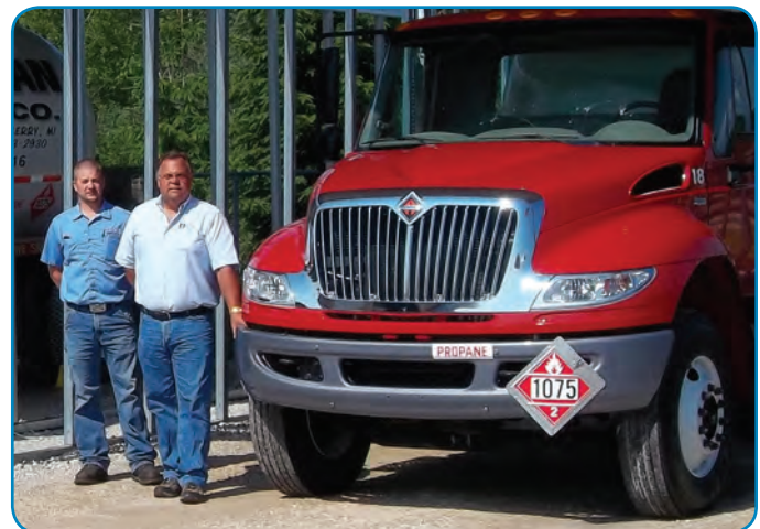
Bowman Gas serves its residential customer base with a six-vehicle fleet of LPG bobtails, all of which are outfitted with sliding vane transport pumps from Blackmer®.

"Around 20 years ago when we were looking to update the Gulliver facility, we did some research and chose IPS to do the update, and from that time on, we have had a relationship where now they do everything for us," said Bowman. "When we built the Newberry and Wetmore