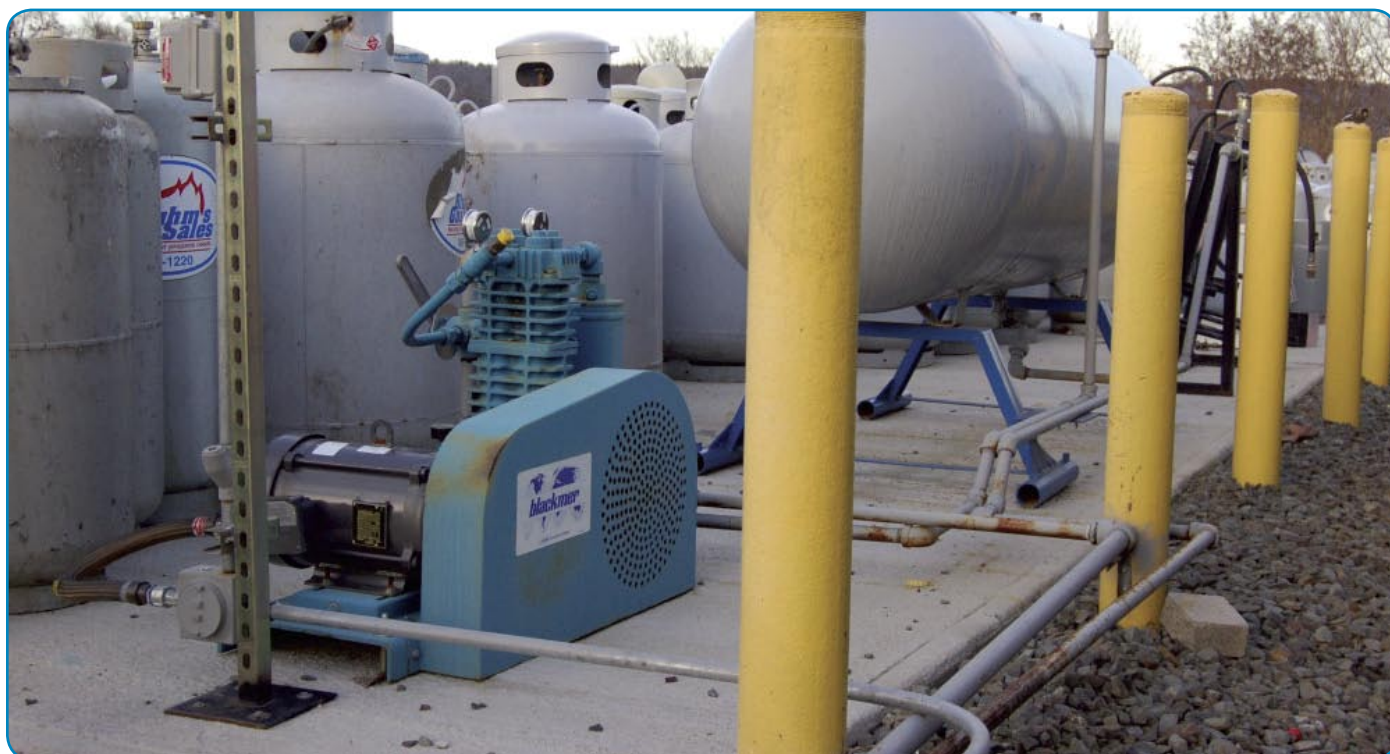
An example of a designated vapor-recovery pad to capture all of the vapors from any tank being serviced.