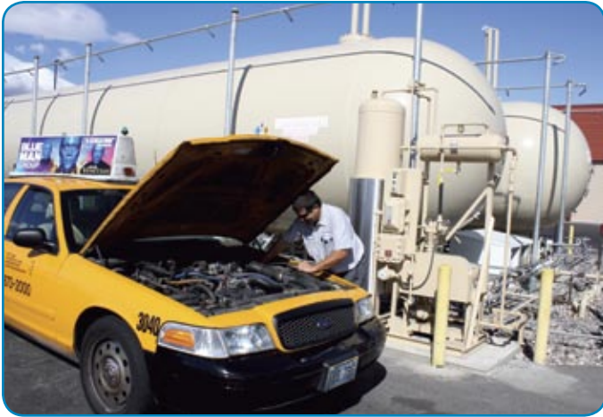
One of the largest taxicab fleets in the United States uses a vapor-recovery system to draw down the vapor level in taxis prior to service. This vapor-recovery system features a Blackmer LB161 Series compressor.

At normal temperatures, LPG will evaporate. Because of this, LPG is stored and supplied in pressurized containers. The pressure at which LPG becomes liquid is called its “vapor pressure,” which varies based on its composition and temperature.