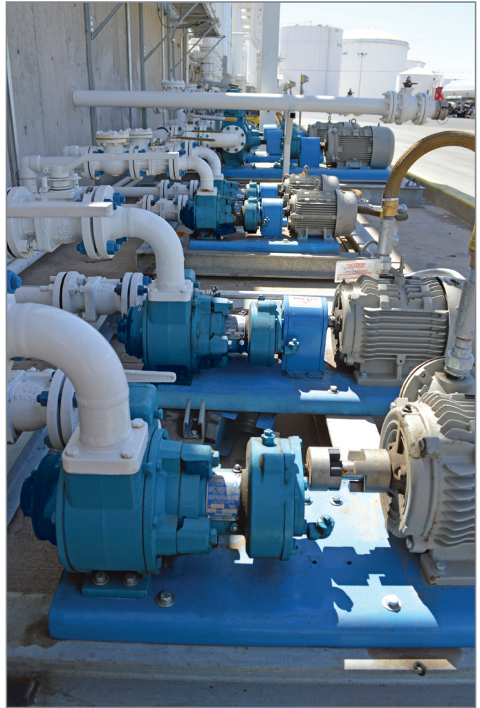
More storage-terminal operators are taking a systems approach to improving the energy efficiency of their facilities and many are realizing that Blackmer® Sliding Vane Pumps can be an important component in an optimized fluid-handling system.

Therefore, liquid-terminal operators that are looking to maximize the throughput and energy-efficiency of their