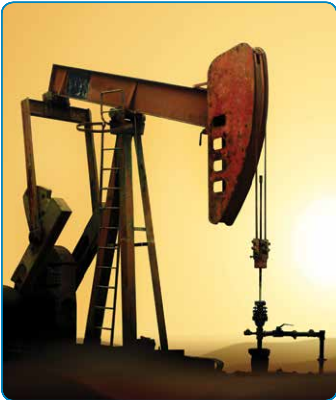
Enhanced Oil Recovery (EOR) techniques are combining with the traditional oil derrick in driving a revived United States Oil & Gas industry that some predict will be the world’s top producer by 2020.

This stunning turnaround is being driven by advanced technologies, such as Enhanced Oil Recovery (EOR) for traditional oil deposits, and newly discovered sources of “unconventional” oil and gas, i.e. the shale plays and oil sands, that point to the eventual recovery of billions of barrels of oil and trillions of cubic feet of natural gas. So, while the race to discover and develop forms of alternative energy continues apace, it appears that oil and gas will remain the go-to energy commodities around the globe for