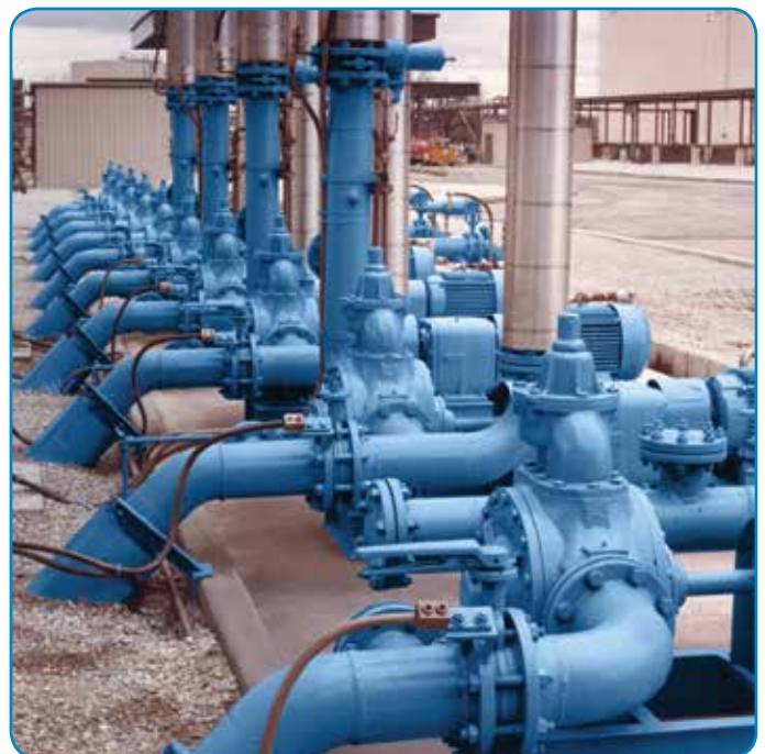
Blackmer® Sliding Vane Pumps stand ready to meet the needs of the rapidly growing Oil & Gas industry in the United States.

All of these characteristics help make sliding vane pumps the technology of choice in critical oil and refined-fuel applications, from the wellhead where the oil and gas exit the ground to the transport truck that makes a retail-fuel delivery.