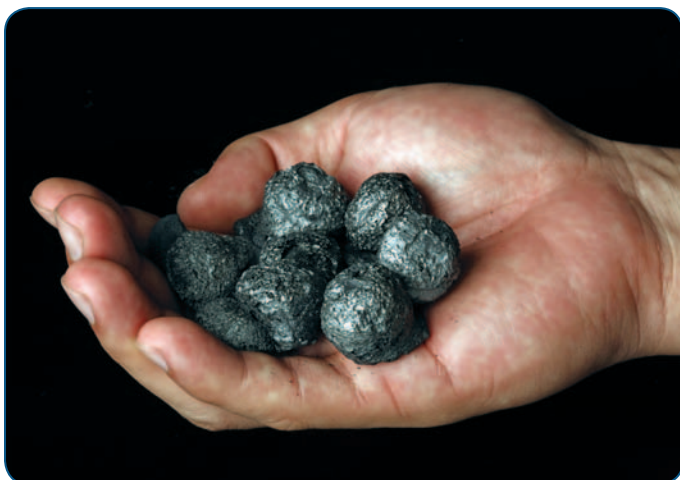
Pumps play a critical role in the coke manufacturing process.