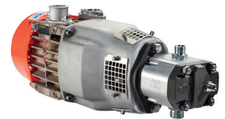
Option: Enterprise with Hydraulic motor drive adaptor