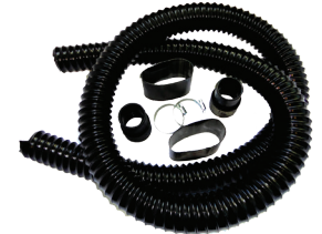
Inlet Connection Kit (Delivered with Enterprise Series)