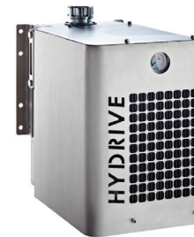
Hydrive Hydraulic Cooler (optional)