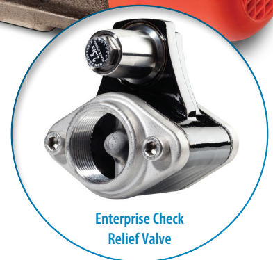
Enterprise Check Relief Valve