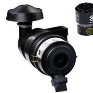
Suction Filter (optional)