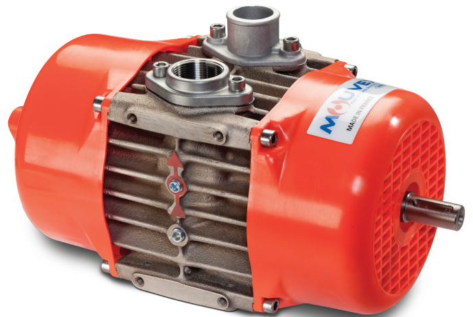
E140 Vane Compressor

Weight: 36 kg (79 lbs.) to 47 kg (104 lbs.)