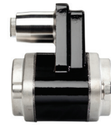
Enterprise Check and Relief Valve (Delivered with Enterprise Series)

The Enterprise Series compressors are available in PTO or Hydraulic Motor drive versions. Accessories available include: