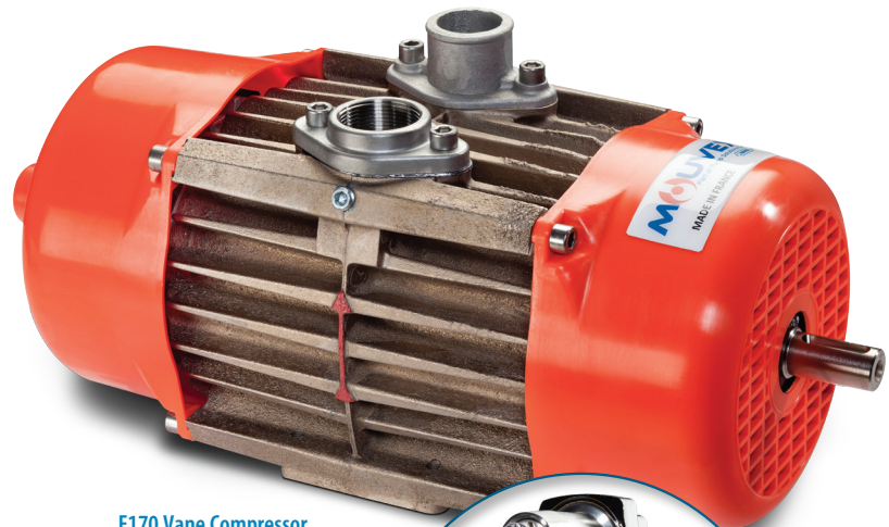
E170 Vane Compressor