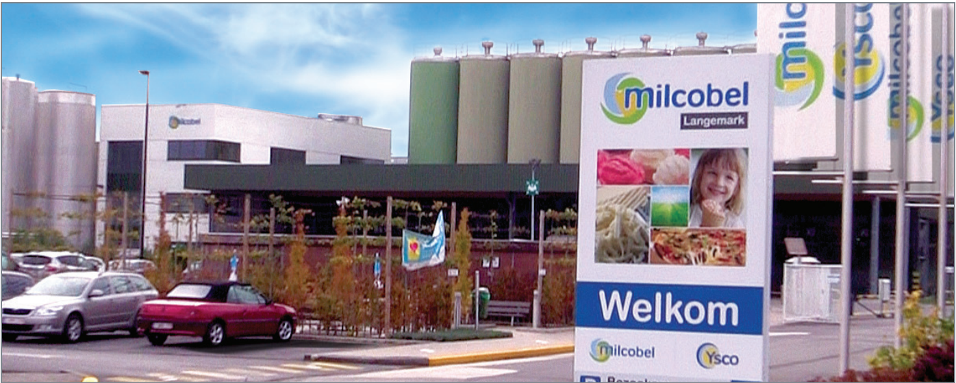
From its production facilities in Langemark, Belgium, and Argentan, France, Ysco annually produces 174 million liters (41.2 million gallons) of ice cream.

freezer, a slow-turning agitator or scraper forces the mix outward, where it briefly touches the frozen outer wall before it is turned back inward. This is when the ice crystals, which eventually become ice cream, are formed. In order to achieve the required taste and expected creamy “mouth feel”, the ice cream mix can only spend a highly regulated amount of time in contact with the freezer’s outer wall. This is why the transfer flow and pressure have to be so accurate.