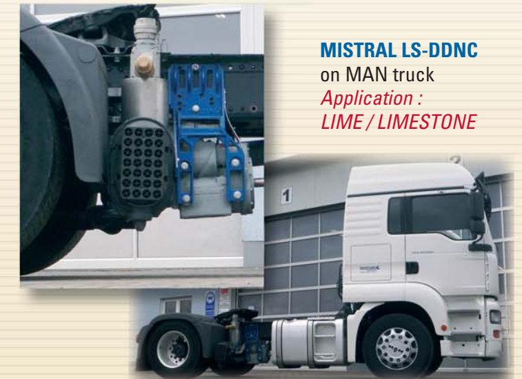
MISTRAL LS-DDNC on MAN truck Application : LIME / LIMESTONE