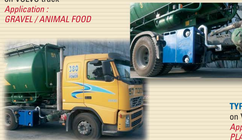
TYPHON II DDIC on VOLVO truck Application : PLASTIC PELLETS