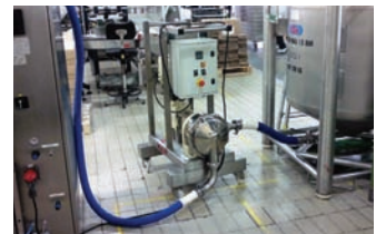
S4C FOR TRANSFERRING