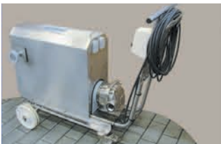
S4C ON MOBILE UNIT