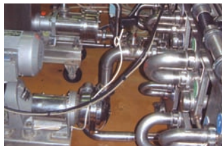
S4C FOR CONDITIONING