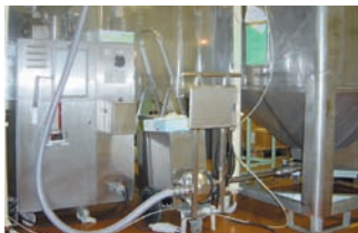
S4C WITH FLEXIBLE HOSE