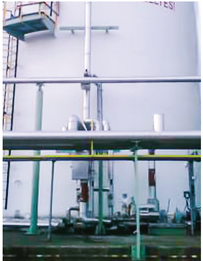
Mouvex® SLC Series and C Series Eccentric Disc Pumps require no magnets, mechanical seals or packing. They are also self-priming, have line-stripping capabilities, can run dry for up to five minutes, produce low shear rates, and can create high vacuum and compression effects. This makes them ideal for the handling and transfer of dilatant isocyanate materials.