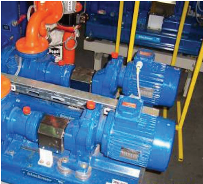
Eccentric disc pumps can be used in the unloading of toxic vapors from tank trucks due to their seal-less design.

isocyanates, particularly during the manufacturing process in the polyurethane foam industry. Additionally, isocyanates are toxics and pollutants, and can be flammable. While their flammability is low, specific concentrations or the presence of explosive vapors or other flammable liquids in the same facility where isocyanates are being used or manufactured can create an explosive atmosphere for plant personnel and the surrounding community.