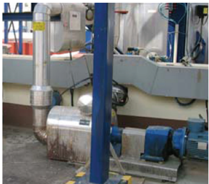
This eccentric disc pump has successfully handled polyurethane paints made from MDI at an automotive paint plant since 2001.

The most common occupational exposure to isocyanates is inhalation of a vapor or aerosol, although exposure may occur through skin contact during the handling of liquid isocyanates. Exposure typically occurs during the production and use of