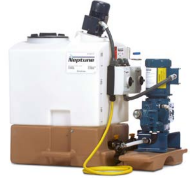
Chemigation System with 500-VS Pump