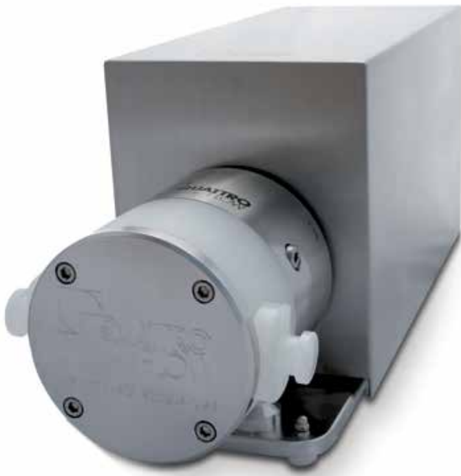
Quattroflow™ QF1200 Single-Use Series Quaternary Diaphragm Pump

The high level of production success that Rentschler has amassed - and the role that Quattroflow pumps have played in it - was acknowledged in 2012 when its 1,000-liter multi-product single-use facility was presented the prestigious Facility of the Year Award in the "Equipment Innovation" category by the International Society for Pharmaceutical Engineering (ISPE), INTERPHEX and Pharmaceutical Processing magazine. The 1,000-liter facility, which features four independent, yet connectable, all-purpose clean rooms, was honored for its ability to minimize manufacturing costs and product cycle times.