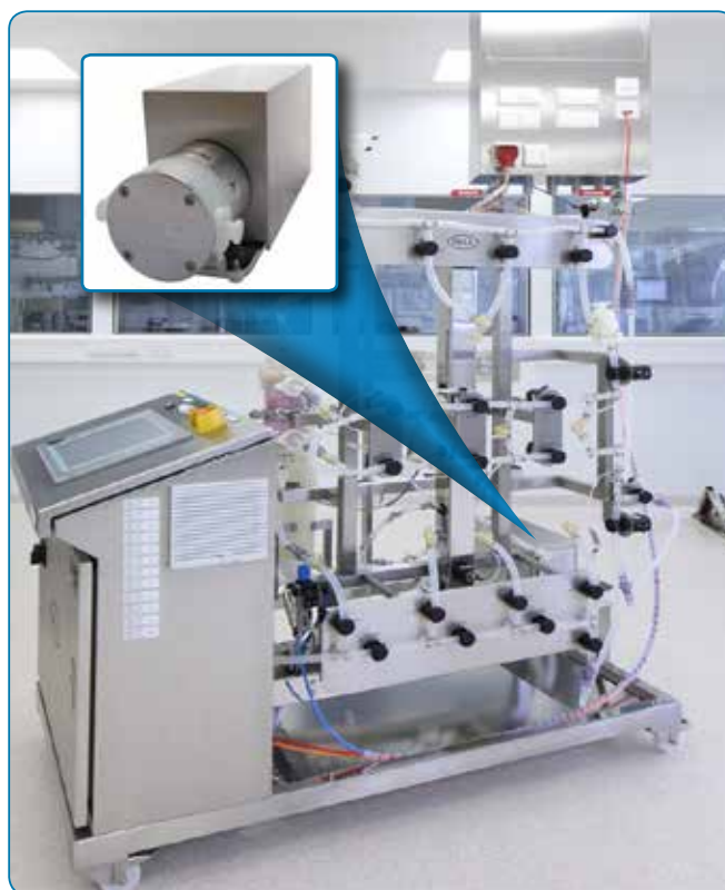
Single-use versions of Quattroflow QF1200 pumps help Rentschler Biotechnologie maximize the speed-to-market capabilities of the biopharmaceuticals that it produces. This is a critical consideration when determining a product’s ultimate market value within its patent window.

“The problem for us is we must be really flexible for the customer,” said Dr. Laukel. “One day we may be working with Customer A, then the next day Customer B, so you have to be really flexible; there is no standard process for us. That’s another reason why the single-use Quattroflow pumps are a good choice for our operations.”