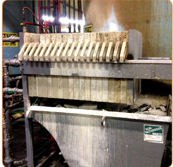
AMTROL's filter presses receive sludge containing water and metal particulate waste pumped by Wilden AODD pumps for separation into solid "sludge cakes" and water for safe, convenient disposal.

pumps then transfer the resulting sludge to holding tanks in a laboratory for final processing by three large recently installed filter presses to separate the sludge into solids and water for proper disposal. Each filter press has eight two-inch wide chambers, and each chamber is equipped with two 24-inch by 24-inch membrane plates.