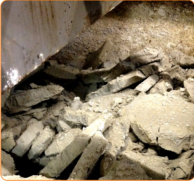
The facility's three filter presses process up to 9,600 gallons (36,340 liters) of waste sludge per day and produce more than 100 tons of "sludge cakes" per year.