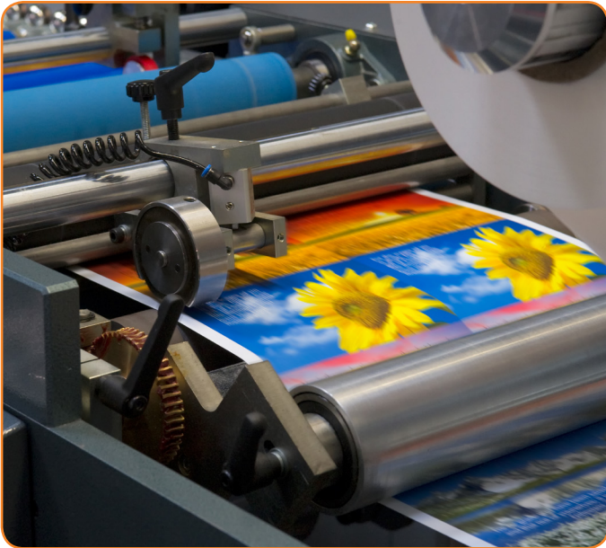
The manufacturing process of high-performance coatings includes the blending of polymer emulsions and resin solutions, two ingredients that can be “very searching” when it comes to their impact on production equipment.

the company has transformed itself into one of the world leading providers of clear coatings for a broad range of graphic applications.