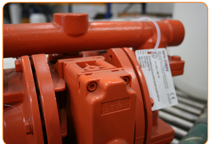
Wilden® AODD pumps offer the leak-free and shear-sensitive operation that is mandatory when working with paint and coatings. Wilden pumps also feature Wil-Flex™ EZ-Install Diaphragms, which are ideal for polymer and resin transfer.

Other benefits of Wilden Advanced Series pumps include their ability to be used in a wide range of pressure and flow specifications, self-priming and low-wear operation, ability to handle difficult solutions, improved energy efficiency, and overall low maintenance costs. In addition, these pumps can accommodate deadheading during