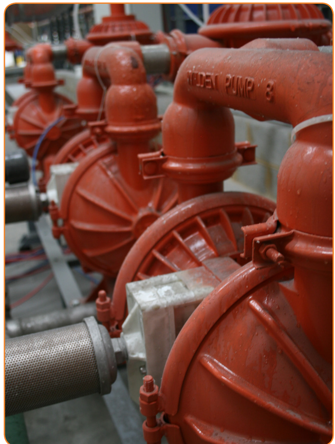
Because of their innovative design features, positive displacement AODD pumps often represent the best technology for handling “very searching” and aggressive liquids used during the manufacturing of high-performance coatings.

While utilizing AODD pumps for a variety of applications, the brand of AODD pumps that Hi-Tech Coatings employed for several years at its previous facility suffered