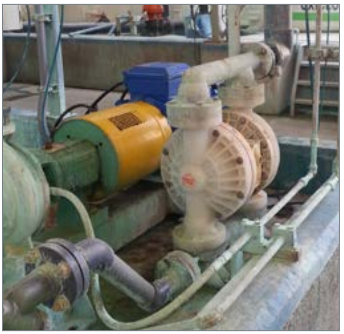
Traditional diaphragm designs feature inner and outer plates that connect the diaphragms to the pump shaft. While this design does have its operational benefits, there are some shortcomings that can lead to the creation of leak points that can affect product containment, which is especially critical when handling dangerous or hazardous materials.

Taking into account the problems that abrasion wear and material buildup can cause, the industry worked diligently to develop the integral piston diaphragm, or IPD. Within the IPD design, the piston that is used to move the diaphragm laterally during the pumping stroke is encapsulated into the interior of the diaphragm itself. IPDs also have a smooth finish with an angle of operation that enhances fluid flow and suction lift while reducing the propensity for material buildup on the outer piston.