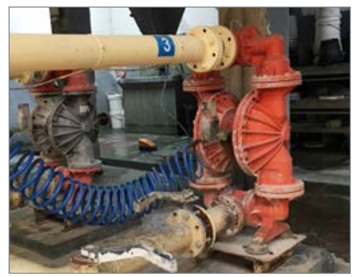
Wilden Chem-Fuse IPDs provide a reliable, efficient and safe solution for improved diaphragm performance, even in the harshest fluid-transfer applications.